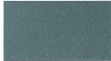
ca. RAL 7031 blaugrau