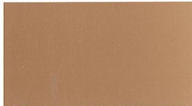
ca. RAL 1011 braunbeige