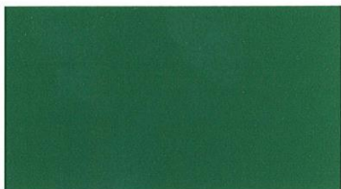
ca. RAL 6002 laubgrün