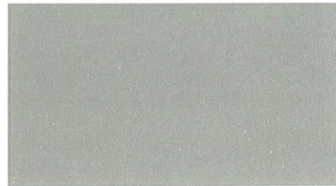
ca. RAL 7030 steingrau