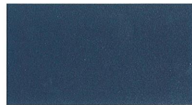
ca. RAL 5013 echtblau