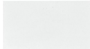
ca. RAL 7035 lichtgrau