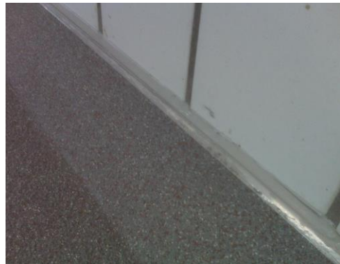
Completed cove with profile