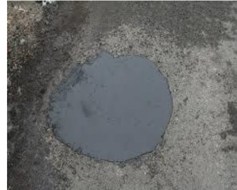
cured within 30 min.

MMA resins have been used for road repairs, as mortar to fill holes fast and for linings since many years. We developed a new combination between MMA und PU. This new type of hybrid resin called PUMMA 800 combines the fast curing advantage of MMA resins together with the flexibility that PU resins can provide also at low temperatures. PUMMA resins are used in areas where a wide range of temperatures between summer and winter / day and night are expected.