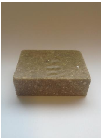
click to see the video.

MMA resins have been used for road repairs, as mortar to fill holes fast and for linings since many years. We developed a new combination between MMA und PU. This new type of hybrid resin called PUMMA 800 combines the fast curing advantage of MMA resins together with the flexibility that PU resins can provide also at low temperatures. PUMMA resins are used in areas where a wide range of temperatures between summer and winter / day and night are expected.