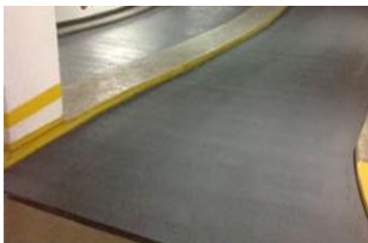
Park deck coatings

The Plastifloor® MMA resins are able to offer a wide range of high performance car park decking, line marking, joint construction and surface marking solutions. Based on the fast curing and incredibly durable MMA and PUMMA resin technology, these MMA and PUMMA resin systems are ideal for high traffic areas and help overcome the installation challenges resulting from long periods of inclement weather. Skid resistance, speed of installation and outstanding durability are some of the most important factors that customers expect, so our systems have been developed to offer highest performance in all of these areas. Plastifloor® is a brand name for MMA and PUMMA based coatings for all of our car park decking, line marking and surface marking systems. Designed for use on both concrete and asphalt substrates, all our systems cure within 1 hour of installation at temperatures down to -20°C/-4°F, making them ideal for use throughout the year. The ultra fast cure time we offer enables projects to be completed quickly thus reducing disruption and lower cost.