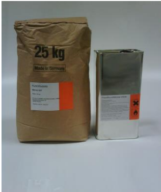
Plastifloor® mortar 050/051

To complement our car park and highways product range, we have also developed an innovative permanent pothole repair solution called Plastifloor® 050/051 ideal for all pothole repairs, small areas of car park or road resurfacing and ironwork re-instatement.