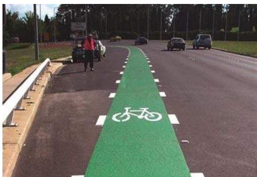
Surface Marking Solutions