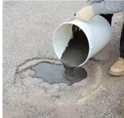
prepacked and ready for use